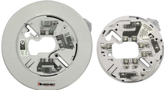
SCI-B67 & SCI-B47